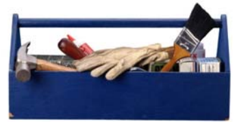
What's in your toolbox?