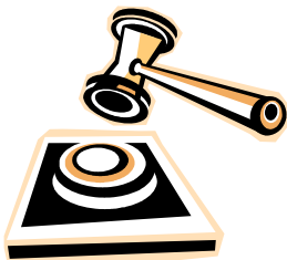
Meeting called to order