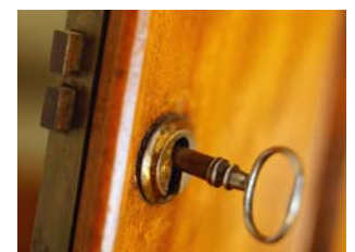
A legacy of craftsmanship